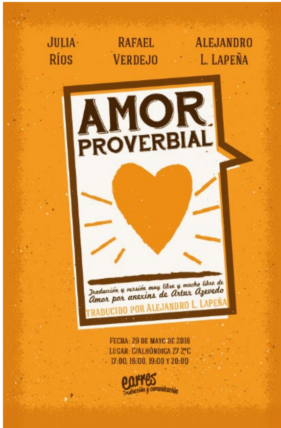
Figure 1. Poster of Amor proverbial

As for the second version, the play was retranslated in its entirety (except for the songs) for the company Lamarisguay. Thus, the third character created for the previous version was eliminated. What is interesting about this version is that the gender of the characters was swapped. As a result, Inês became Francisco, a young tailor waiting to marry his boyfriend, and Isaías became Antonia, a woman very fond of proverbs. The reason behind this decision was, on the one hand, to distance the new translation from