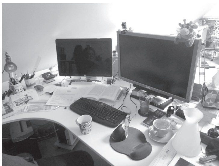
Figure 2. The front part of the translator's workplace (the Union Jack coffee cup was only placed on the desk after the observed working period).

figure 2): From right to left, she has her mobile phone, two screens (each with a specific function), a keyboard in front of them, a pile of notepaper and a pen between the screens (behind the keyboard), an iPad, a printer, files and folders, various books and dictionaries and a shredder. There are only a couple of books on the desk (e.g., on English style, a parallel text); most other translation-related books (e.g., dictionaries, grammar books, etc.) are stored in a bookcase directly behind her seat, but none of these were used during the observation period.