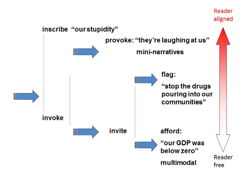
Figure 3. Revised strategies for inscribing and invoking attitude based on analysis of Trump's speeches

Martin and White (2005: 67) incorporating two new features: the strategy of provoking the audience through the use of mini-narratives designed to make a point and trigger affect/judgement, and the affordance of affect/judgement/ appreciation through multimodal messages in which a verbal affordance is contrasted with a visual one.