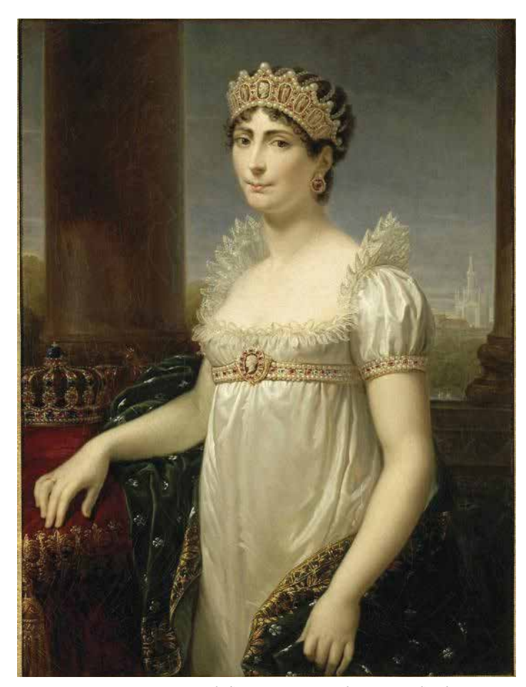
Fig. 8. Andrea Appiani, Portrait de l'impératrice Joséphine, reine d'Italie 1807, Musée National des Châteaux de Malmaison et de Bois-Préau, Rueil-Malmaison

It is also worth noting the Portrait of the Empress Joséphine, Queen of Italy (Andrea Appiani, 1807, Musée national des châteaux de Malmaison et Bois-Préau). This canvas is next to Napoleon King of Italy , of which several examples are known (Vienna, Kunsthistorisches Museum, Dalmeny House, Écosse, Rosebery collection; Napoleonien Musée de l'île d'Aix). Joséphine wears a coat of green velvet embroidered with silver flowers, such color and metal were used for the royal ornaments in Italy; near her is the crown she wore in the coronation as the queen consort on May 26, 1805; in the distance, a view of the capital of the kingdom, Milan, can be seen with the silhouette of