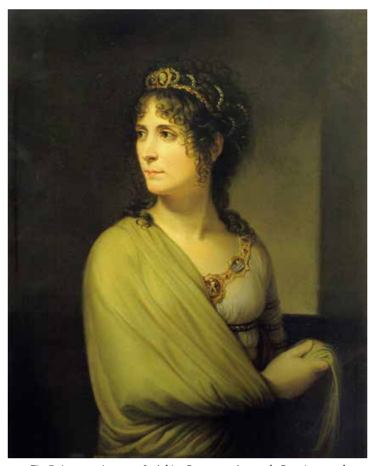
Fig. 7. Andrea Appiani, Joséphine Bonaparte épouse du Premier consul c. 1801, private collection, Belgium

seductress, emphasizing her beautiful features. Her loose hair of a natural color, in contrast with the powdered wigs in the Bourbon period, denotes a connotation of revolution transcending the simple environment of fashion and turning into the realm of thought that foreshadows a new historical period. The diadem in her brown hair is centered with a cameo which reproduces what looks like the profile of a Roman bust properly adapted to the physiognomy of Napoleon.<sup>74</sup> Not only is the presence of the emperor remarkable in the cameo and in the display of a performance dedicated to the emulation of the classic