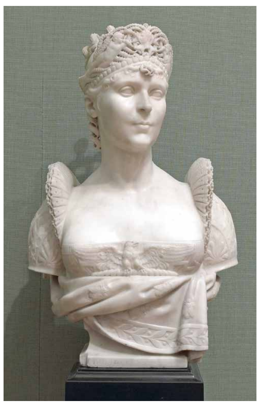
Fig. 5. Joseph Chinard, L'impératrice Joséphine 1805, National Gallery Canada, Ottawa