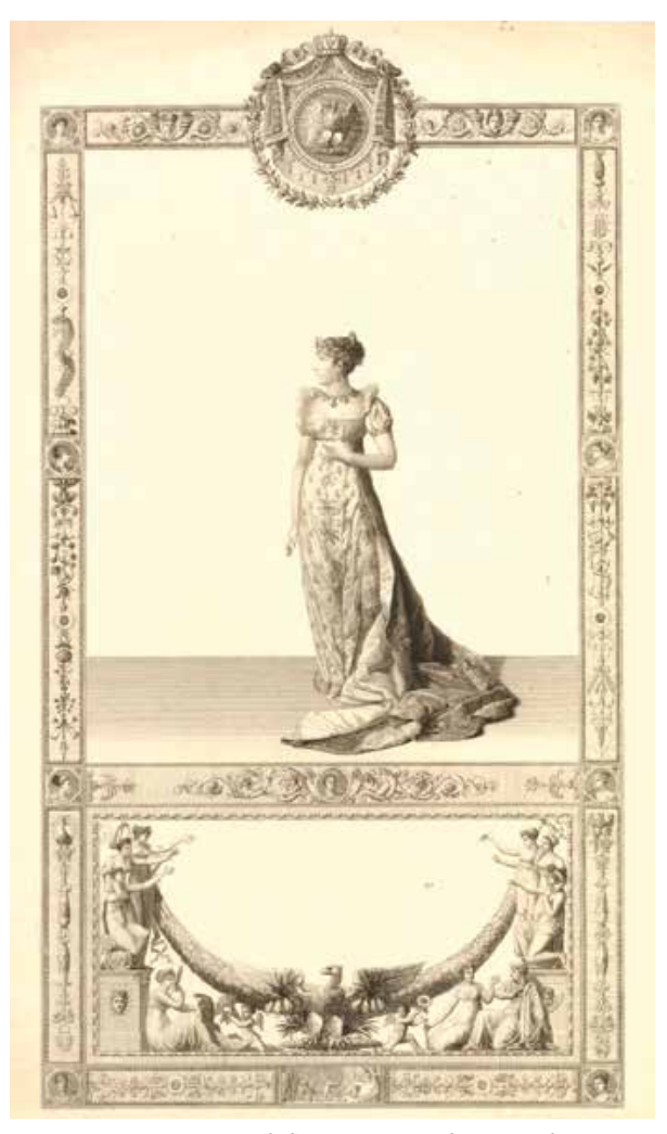
Fig. 1. Jean-Baptiste Isabey, Le Sacre de l'empereur Napoléon. Joséphine en Petit habillement, 1805, Musée du Louvre, Paris