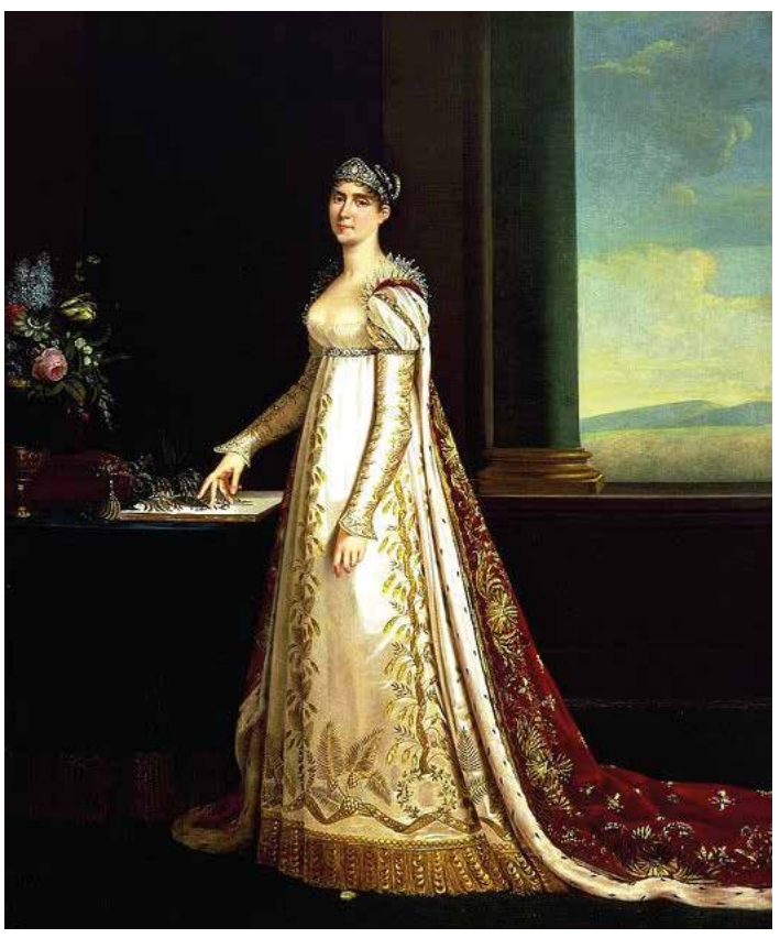
Fig. 4. ROBERT LEFÈVRE, L'impératrice Joséphine 1805, Malmaison et Musée de Picardie, Amiens

dress with on embroidered collar in Cheruscan style, an ermine coat and a set of jewelry made of pearls. <sup>56</sup> Jean François Soiron (1756-1812) implemented several portraits of the imperial couple, one of which was presented at the Salon of 1808. It was a portrait dated 1807, belonging to the Wicander collection, preserved in the National Museum in Stockholm which was inspired by miniatures made by Jean-Baptiste Isabey ( Portrait of Napoleon Foundation of Napoleon and Joséphine portrait , Musée du Louvre, Arts graphiques). <sup>57</sup> In it, the Empress not only exhibits the imperial robe and eagle with his wings spread which are symbolizing the rule of her sponse but she also partners with a portrait of himself.